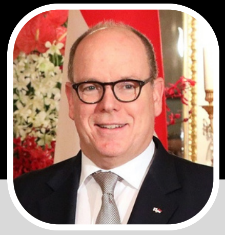
ALBERT II PRINCE OF MONACO (Father)