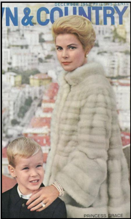
Grace + Albert II